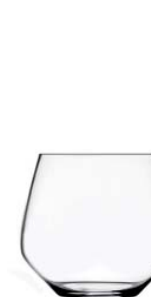
Whisky d. o. f. Whisky d. o. f.

81 mm h, ø 86 mm 3,2" h, ø 3,4" 320 ml 11,3 fl. Oz.