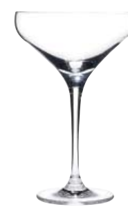
Martini / Cocktail Martini / Cocktail

175 mm h, ø 114 mm 6,9" h, ø 4,5" 280 ml 9,5 fl. Oz.