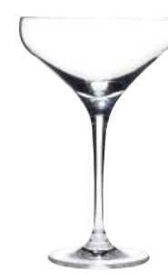
Martini / Cocktail Martini / Cocktail

175 mm h, ø 114 mm 6,9" h, ø 4,5" 280 ml 9,5 fl. Oz.