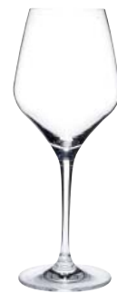
Rotwein Red Wine

233 mm h, ø 91 mm 9,2" h, ø 3,6" 470 ml 16,0 fl. Oz.