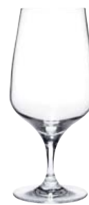
Iced Tea Iced Tea

199 mm h, ø 89 mm 7,8" h, ø 3,5" 540 ml 18,4 fl. Oz.